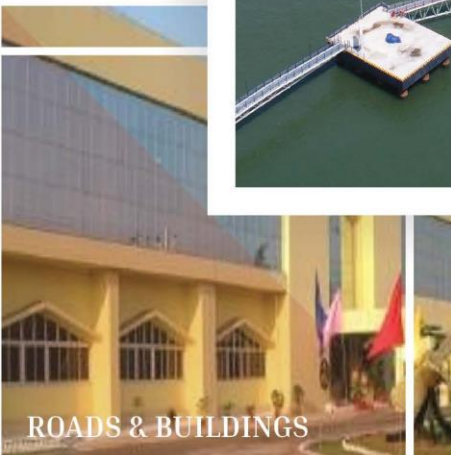
ROADS & BUILDINGS