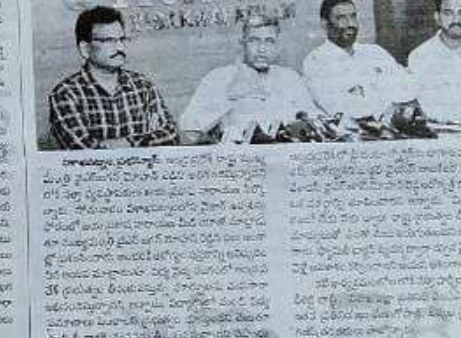
ఫ్యామిలీ డాక్టర్ వ్యవస్థ అభినందనీయం

• లాంఛన్ ట్యాబ్లెట్ల, హాస్టల్ ఆహార భద్రత కమిషన్ ఆకస్మిక తనిఖీలు