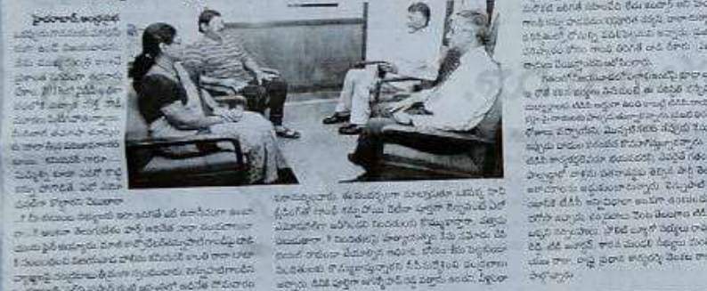
పంజాబుల నాయకుల నేతలే లెఫ్టనెంట్